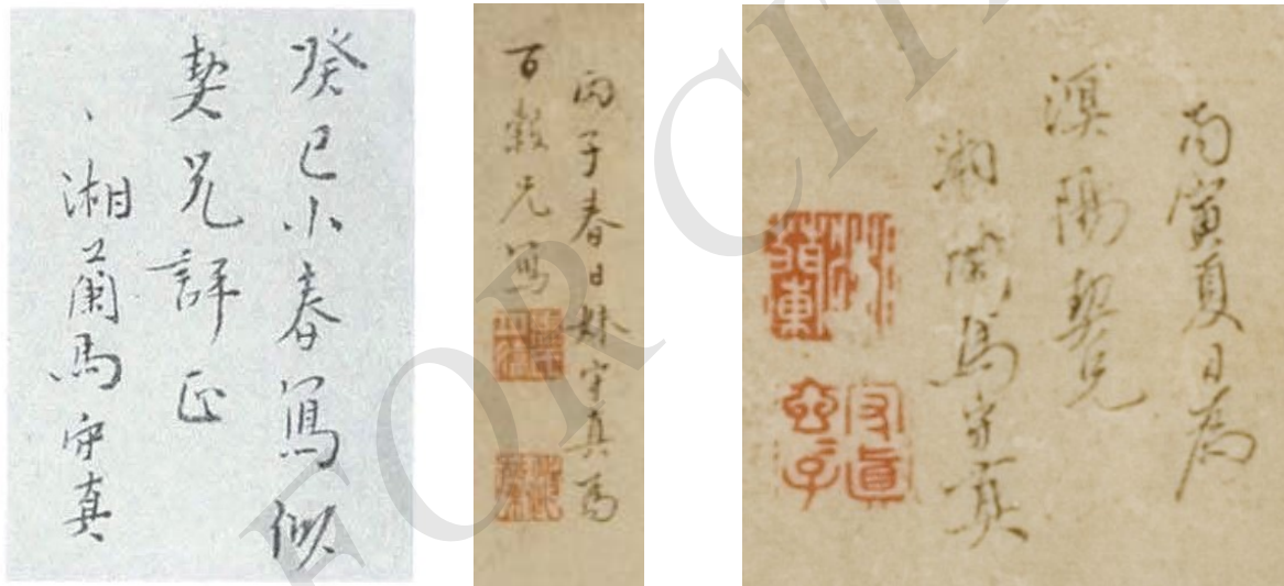
Plate 1: The Authentic Signature (left) by Ma Shouzhen and the fake ones (middle and right) on the current handscroll attributed to her.

Although this seal, as we found, was impressed on the painting dedicated to Cai Maozhao that Pei Jingfu did not mention at all, most likely this current handscroll (or the two original paintings in it) once belonged to Pei Jingfu. As for these two fake paintings, they could be made in the 1700s when Ma Shouzhen's works became popular once again among literati.